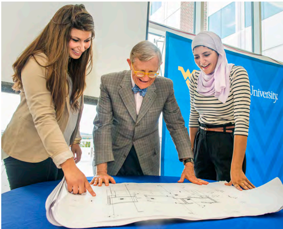
The WVU Solar Decathlon Team took home two wins and some lessons learned.

While it didn't come away with the victory, West Virginia University and University of Rome Tor Vergata's Solar Decathlon 2015 team did bring home first prize in two categories along with major lessons learned from the competition.