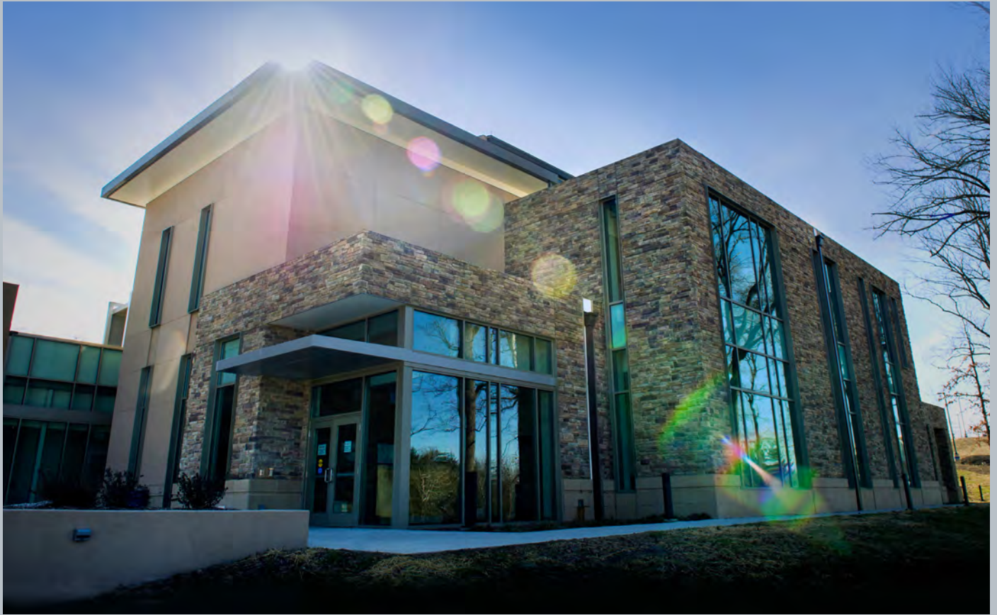
From contemporary art to timeless masterpieces, the WVU Art Museum holds the cultural offerings and imaginations of our region.

For decades, there were those who dreamed of West Virginia University's first art museum. In the meantime, WVU amassed an art collection of more than 3,000 works, visited by scholars and students with appointments.