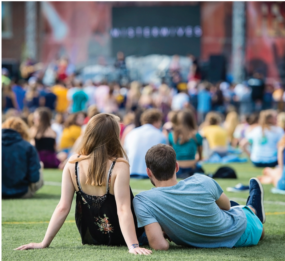
New WVU Freshmen students enjoy an evening of music, friendship and relaxation at Fallfest.