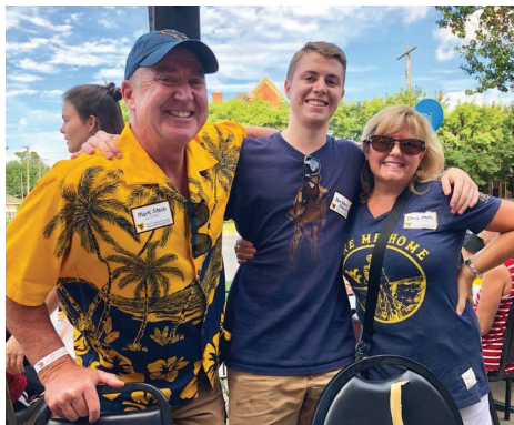
Having a great time at the Central/Southern Ohio Mountaineer Parents Club Summer Send-off.