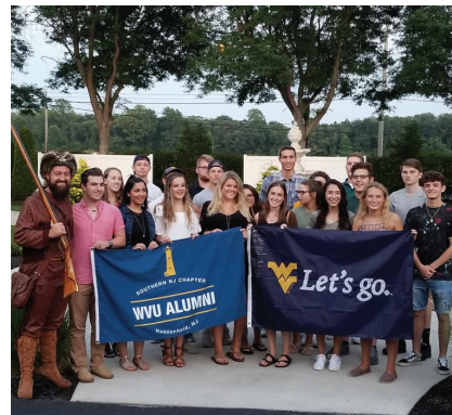
The Mountaineer had a great time meeting students at the Southern New Jersey Mountaineer Parents Club Summer Send-off.