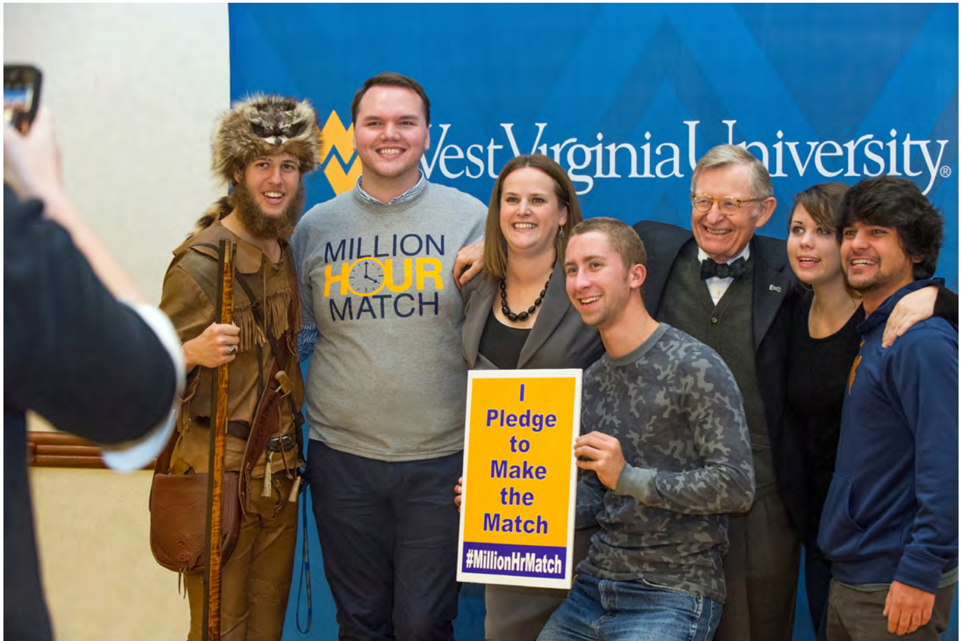
Students, faculty and staff are all making the pledge to donate their time to help out communities around West Virginia.

WVU has thrown down the gauntlet for goodness: Students, faculty and staff are urging West Virginia residents to match them in completing one million hours of community service by 2018.